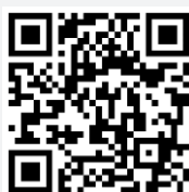
E-book manual for e-Request