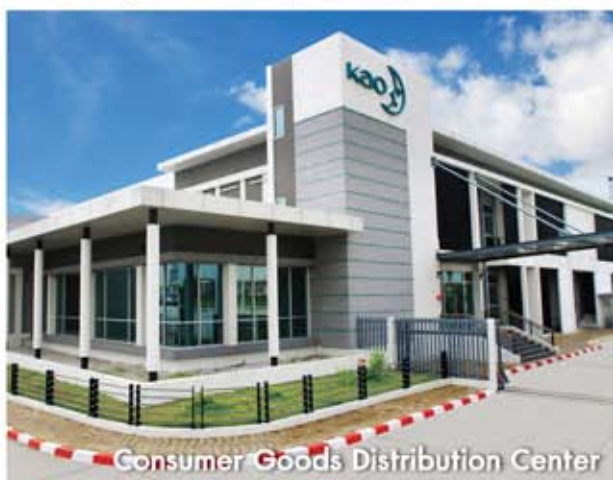
Consumer Goods Distribution Center