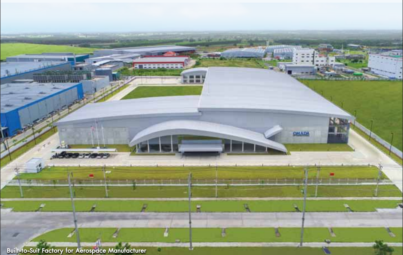
Built-to-Suit Factory for Aerospace Manufacturer