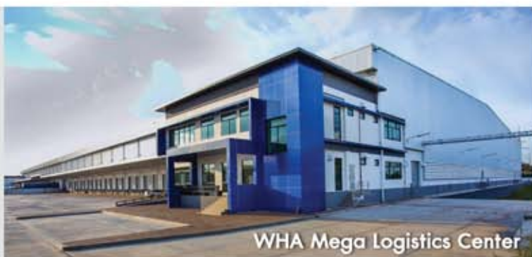
WHA Mega Logistics Center