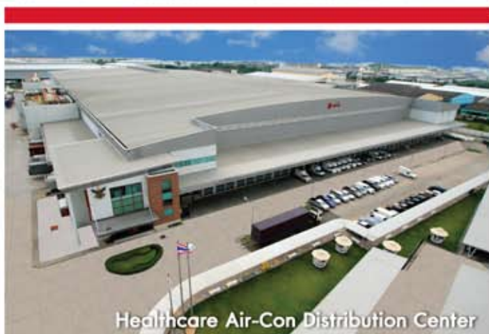
Healthcare Air-Con Distribution Center