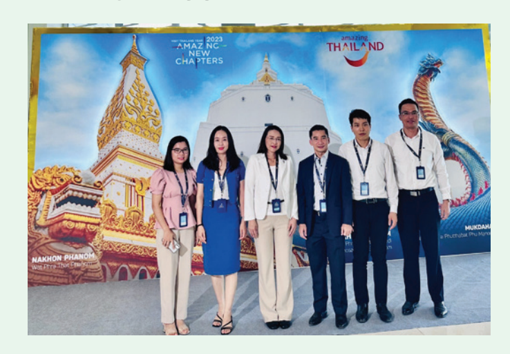
In the picture: WHA's representatives join Meet Thailand. event

On the occasion of the 47<sup>th</sup> anniversary of the establishment of diplomatic relations (1976-2023) and a decade of the empowering Vietnam-Thailand strategic partnership (2013-2023), the People's Committee of Quang Tri province in collaboration. With the Ministry of Foreign Affairs and Thai Embassy in Vietnam to host a conference "Meet Thailand" on August 3-4, 2023, at Dong Ha City, Quang Tri province.